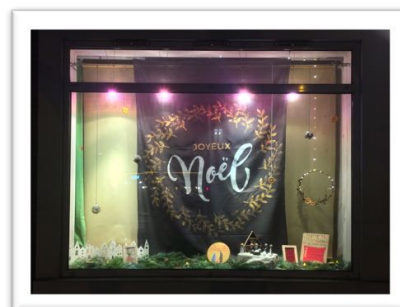
Lucy decorated our church window for Christmas