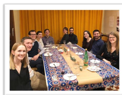
Final meal with all who started in Jan and stayed to the end